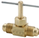
NV102F Flare page H12