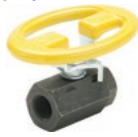
XV500CS-X-21 Carbon Steel page H6