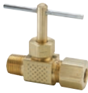
NV106C-NV106CA Compression - Pipe page H13