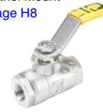
XV502SS-X-20 Panel Mount page H8