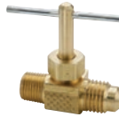
NV103F Flare - Male Pipe page H13