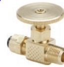
NV311P Poly-Tite page H13