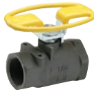
XV502CS-X-21 Panel Mount - Carbon Steel page H7