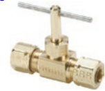
NV105C-NV105CA Compression page H13